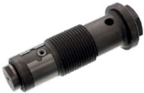
SWAG 10 94 0152

Rattling noises may be heard after a cold start in models with M271 engine (EVO). This may be caused by wear of the chain drive, sprockets, or elongation of the timing chain. This can lead to incorrect timings and, in the worst case, to engine damage. It is advisable to check the chain drive if the problem described above occurs. However, this is a very time-consuming process.