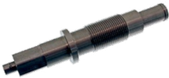
Measuring chain tensioner SWAG 10 94 0125