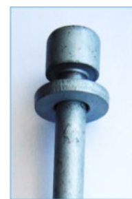
Bolt with flange in its head