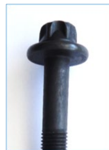
Bolt with washer under the head

On the other hand, some bolts, instead of the washer, include a "flange" together with the head that has the same function