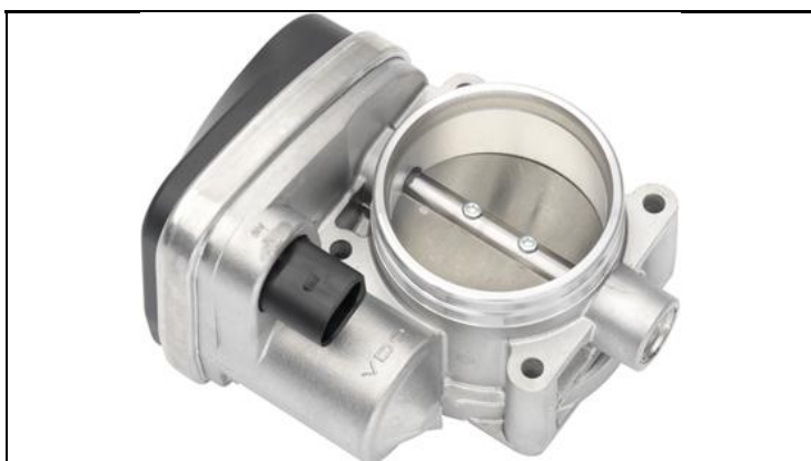
1 - Produkt / Product