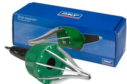
Expander tool: VKN 402

The VKJP 01011 made with stretchy rubber guarantee fast and easy assembly with the SKF air operated expander tool VKN 402, without removing the CV-joint from the shaft.