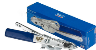
Tightening tool: VKN 400

For a professional repair when tightening the clamps, it is recommended to use the SKF tool VKN 400. Incorrect tightening of the clamps can cause premature failure of the CV-Joint!