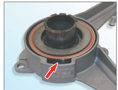
Fig. 3: Correct

In order to avoid damage to the clutch and the transmission as well as additional unnecessary repairs, the correct positioning of the release bearing in the concentric slave cylinder must be verified (see fig. 3 ).