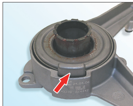
Fig. 2: Wrong

Note the specifications of the vehicle manufacturer!