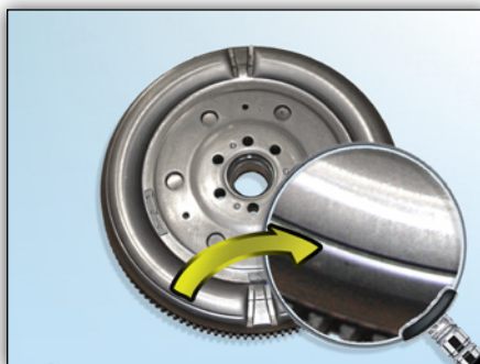
Image 6: LuK DMF; engine side with indentation around the circumference