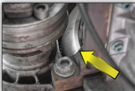
Image 3: The different features are visible once the cover plate has been removed.

Images 4–7 show the different features of both dual-mass flywheels. When installed in the vehicle, these features can be seen in an inspection window in the transmission bell housing (see image 3).