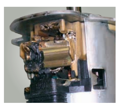
Damage symptoms: melting traces on the electric motor or on the electrical contacts

The right of changes and deviating pictures is reserved. For assignment and replacement parts, refer to the current catalogues, TecDoc CD or respective systems based on TecDoc.