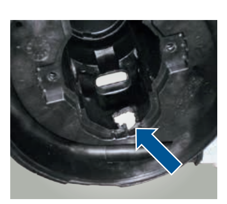
Damage: melting traces on the housing (top view into the housing)

· The secondary air pump has to run for about 90-120 seconds after a cold start of the engine.