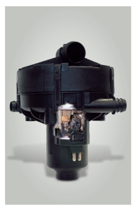
View into the secondary air pump (cut) with melting traces