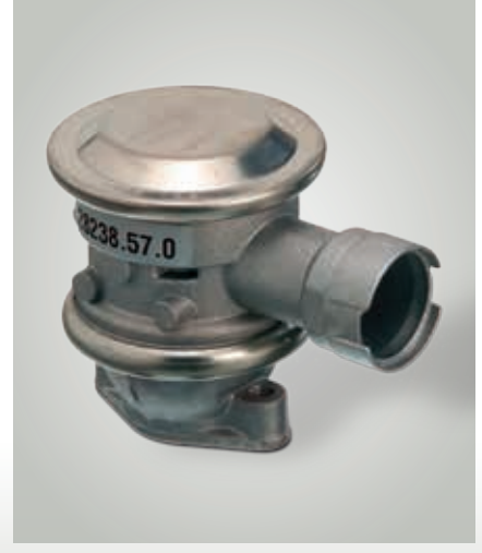
Pressure-controlled valve with shut-off and non-return function (since approx. 1998)