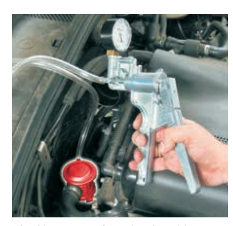
Checking a secondary-air valve with a vacuum hand pump