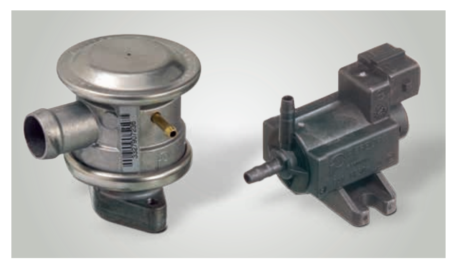
Vacuum-controlled valve with shut-off and non-return function (since approx. 1995) and solenoid switching valve