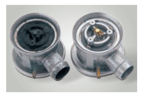
Open secondary-air valve left: damage caused by exhaust gas condensate, right: as-new condition

· Check the connection for leaks and re-seal if necessary.