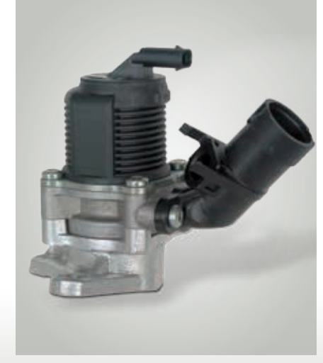
Solenoid Secondary-air valve (since approx. 2007)