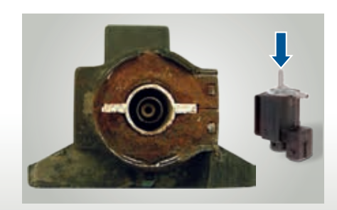
Corroded solenoid switching valve (open)