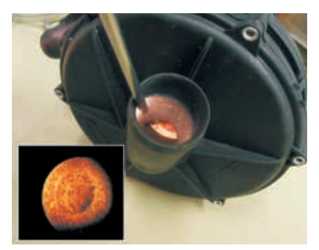
View of the corroded inlet of a secondary-air pump