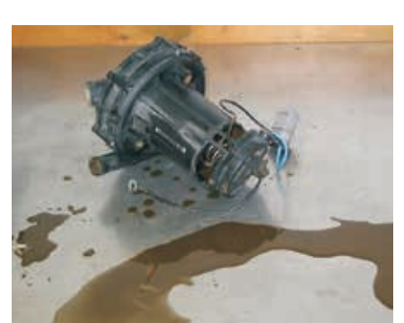
Liquid exhaust gas condensate from a secondary-air pump