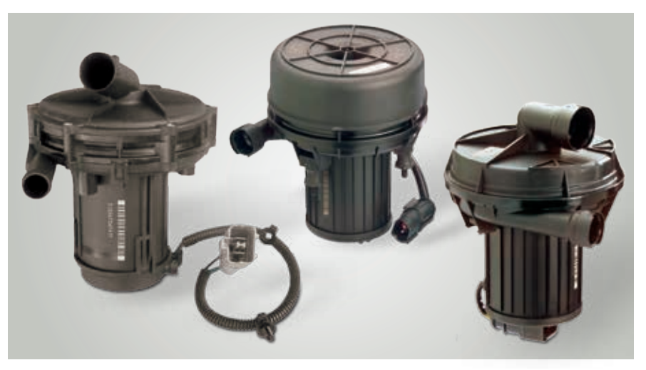
Various 1st and 2nd generation secondary-air pumps

Solenoid secondary-air valves may be equipped with an integrated pressure sensor for on-board diagnosis (OBD) monitoring.