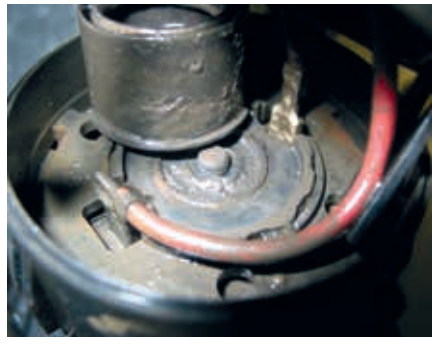
Corrosive exhaust gas condensate in the drive motor of a secondary-air pump

If the secondary-air is drawn in directly from the engine compartment rather than from the intake system, the separate air filter fitted upstream of the secondary-air pump may be clogged.