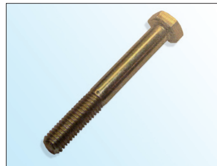
Fig. 2: OE bolt

As part of the continuous development of our products and quality assurance, LuK AS now supplies a new bolt ( fig. 3 ) with the tensioning pulley 531 0278 30 .