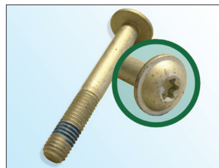
Fig. 3: LuK AS bolt

LuK AS recommends replacing the original bolt ( Fig. 2 ) with the supplied bolt.