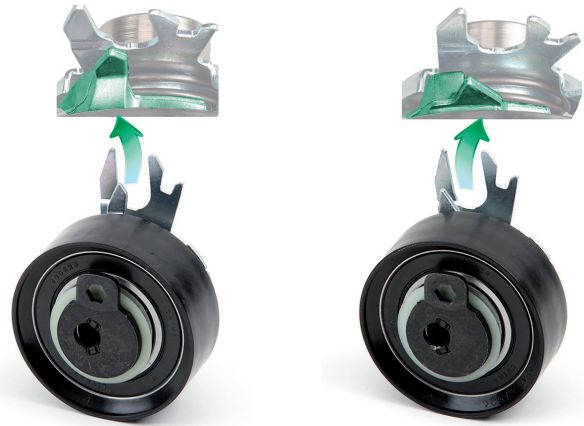
Fig. 1: Left - tensioner pulley 531 0252 30, right - tensioner pulley 531 0525 30

Although they look very much the same, they are technically very different. Tensioner pulley 531 0252 30 has a higher tensioning force and a larger working range than tensioner pulley 531 0525 30.