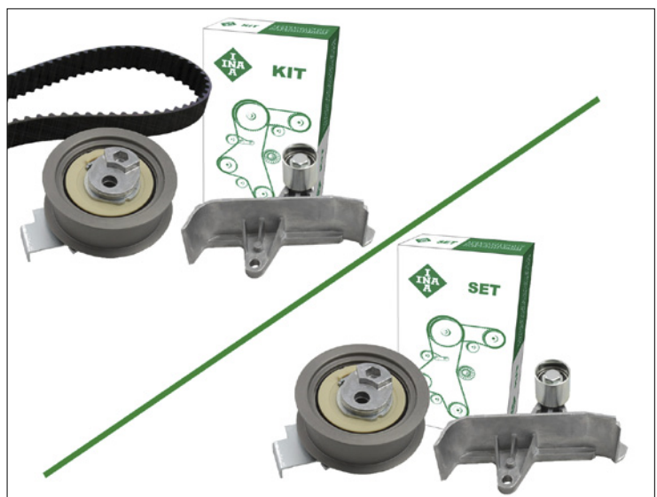
Image 2: KIT 530 0546 10 (left), Set 530 0546 09 (right)

The use of mixed components is not permitted, as the components are adapted to one another and only ensure the correct belt tension when used together.