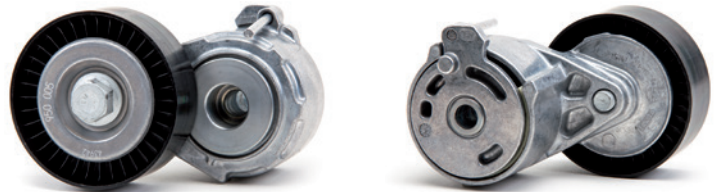
Figure 2: New design

As part of our continuous efforts to improve our products, modifications have been made to the belt tensioner with part number 534 0110 20.